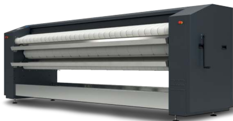
I50 model with XControl FLEX PLUS